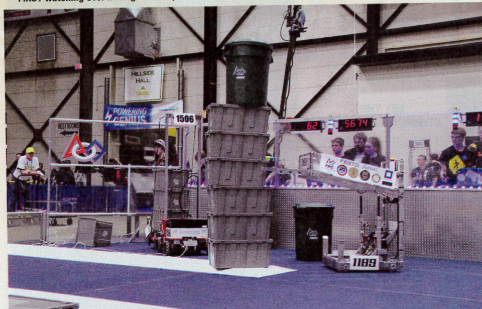
Positioning Totes and Recycle bins on scoring line.