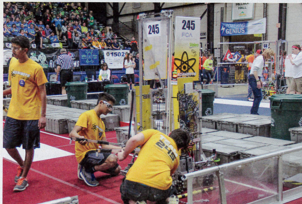
Preparing for the start of competition.

trash. At the beginning of the match there is a 15 second time period in which the robots must perform autonomously with the rest of the match being guided by student operators. Three teams form an Alliance and must work cooperatively to accomplish the Recycle game's end result which is to have stacked totes and recycle bins placed in scoring areas. The more totes a team can stack, the higher the point value.