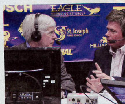
Governor Snyder being interviewed by Detroit Public TV.