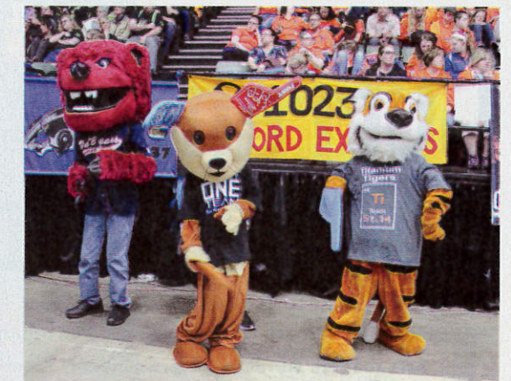
Team mascots kept the crowd entertained.

Robot Magazine: Governor, what is the greatest impact you believe robotics compe-