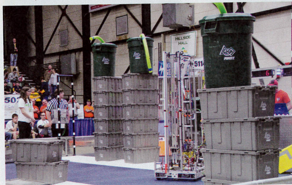
Two packages on scoring platform with a third ready.

would gather their recycle bins then would quickly start gathering totes, pushing each tote upward as it slid another tote in place ready to be delivered to a scoring position. In addition to the totes and recycle bin, each team had to deal with litter in the form of pool noodles, which is not an easy task. However, during the day's competition there were many towers of tote bins and recycle bins falling over due to miss-alignment or bumping.