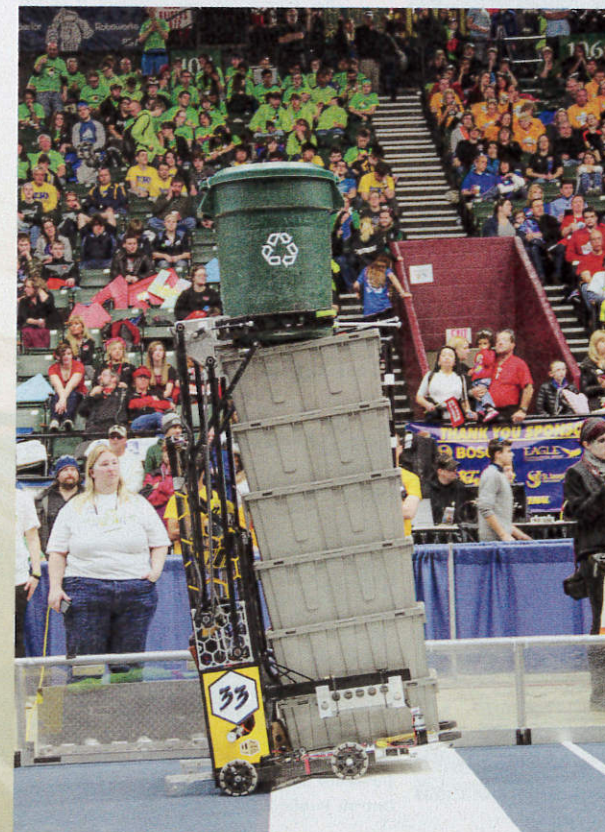
Left: Moving into scoring position.

The final day's competition went smoothly, especially due to the incorporation of two gaming fields, which moved the activities of the day on quickly. Each team