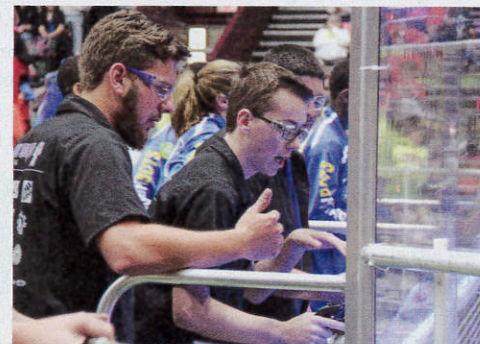
Teams work hard behind protective plastic barrier.

"Recycle Rush" is a representation of real life robots moving items, possibly around a factory floor. The teams must score points by stacking totes on scoring platforms, capping those stacks with recycling containers, and disposing of pool noodles which represent