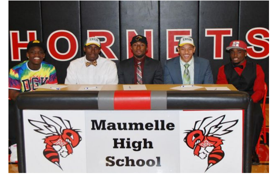
Table with the team or high school banner on front like this. Students may sit behind the table with parents behind them facing the audience

Each student individually recognized with their family, along with a slide of their college and study.