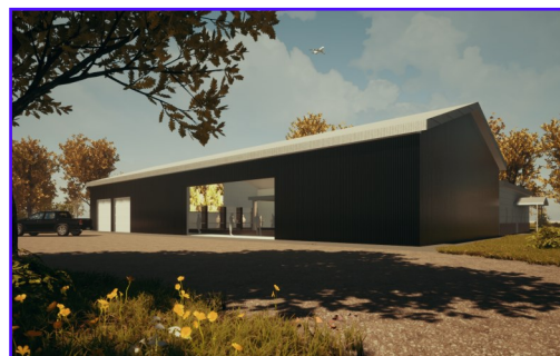
North STAR Center: Exterior Artist Rendering