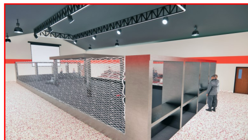
North STAR Center: Interior Artist Rendering